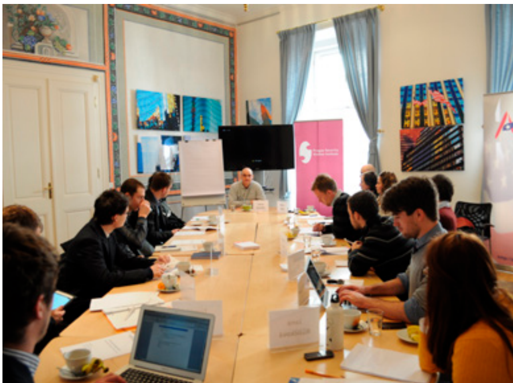
Václav Bartuška, Ambassador-at-Large for Energy Security of the Czech Republic, giving lecture to students of the Intensive Course on Energy Security.