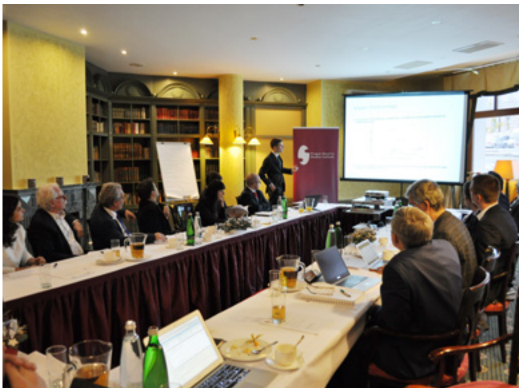
Participants of the Roundtable on Russian State-Owned Energy Enterprises' Activity in Central Europe and Eastern Europe.