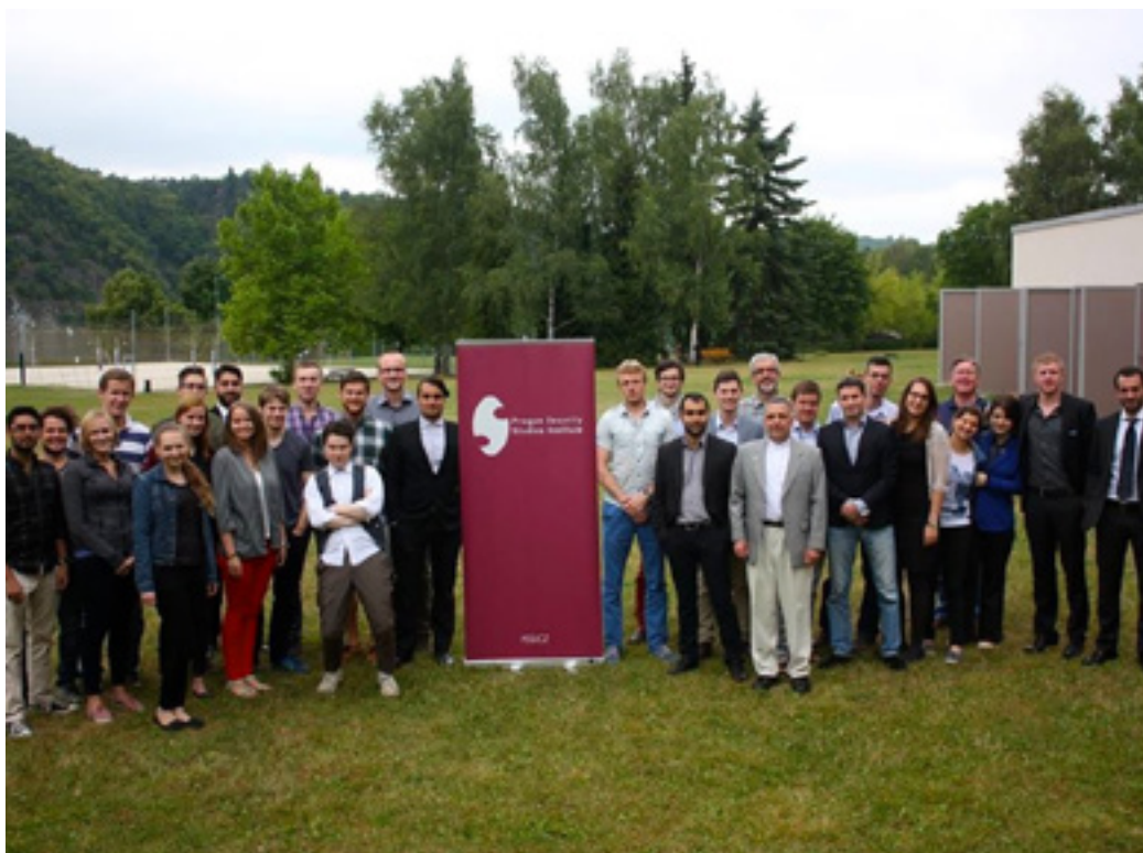
Students of NATO Summer School 2014, in Meřín, Czech Republic.

presentations. About a dozen nations are generally represented.