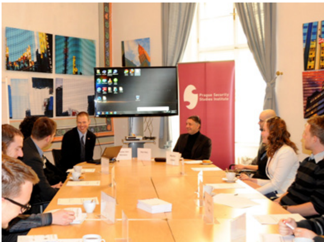
Students of the Intensive Course on Energy Security in American Center in Prague